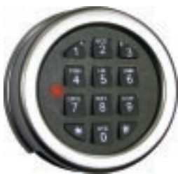
AL20-20 Alpha1 series

Is compatible with following dials from NL Lock range