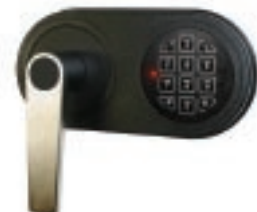
EC10-70 EuroLine series