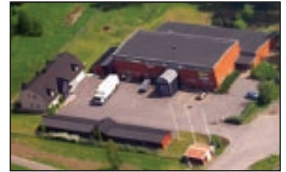
• KG Group, Stockholm, Sweden

is a Swedish company with more than 30 years of experience in high-security locks business. During that period KG Group (former La Gard Scandinavia) has successfully established itself as a reliable supplier of mechanical key and combination locks, high-security electronic locks and sophisticated locking solutions for securing cash in transit. We are proud to be a provider to major manufacturers of safes, ATM machines, vaults and other value storage units.