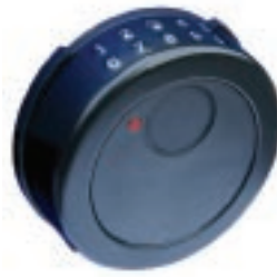
BR50-10 Bravo series