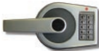
EK50-70 EuroClass series