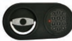
EC10-40 EuroLine series