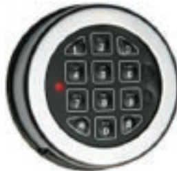
AL30-20 Alpha2 series