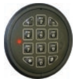
ST40-15 EuroLine Modular Series