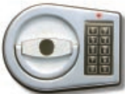
EK50-40 EuroClass series