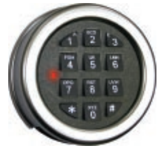
AL20-20 Alpha 1